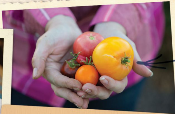
Tasted delicious tomatoes straight off the vine. -Day officially made.