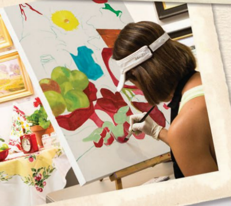
Art imitating life imitating art...

Free your inner maverick at TravelPaso.com