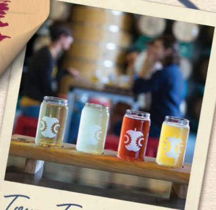
Tour. Taste. Repeat.