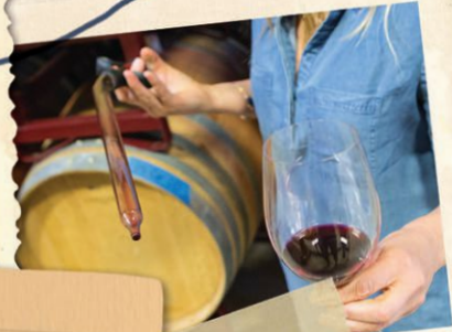
A barrel tasting or three. (No, it's not a turkey baster!)