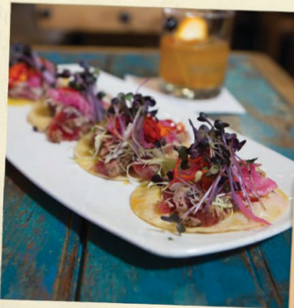
In Paso, Taco Tuesday is 7 days a week!