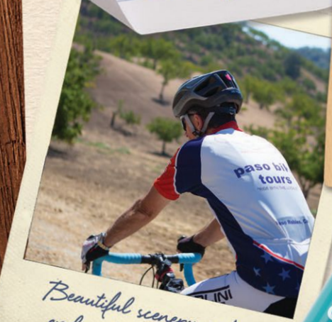
Beautiful scenery is best explored on two wheels.